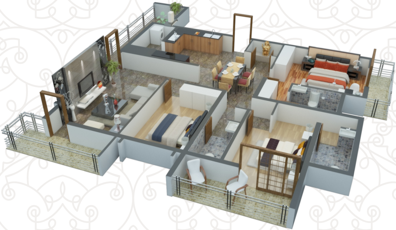
Floors (2-8) - Front - Northern Wing