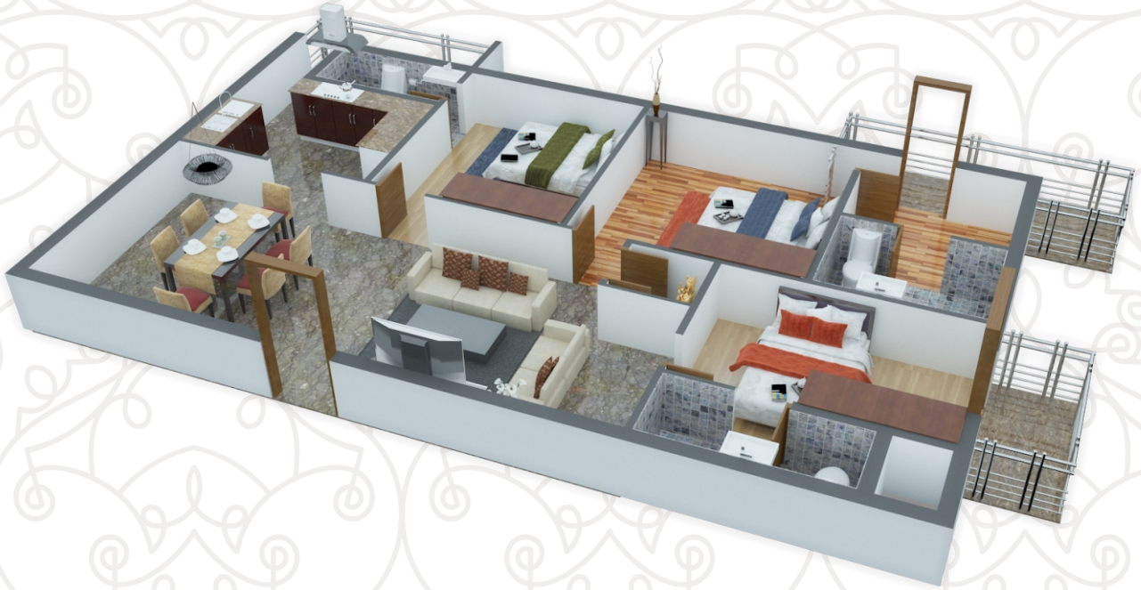
Floors (2-8) - Back - Southern Wing